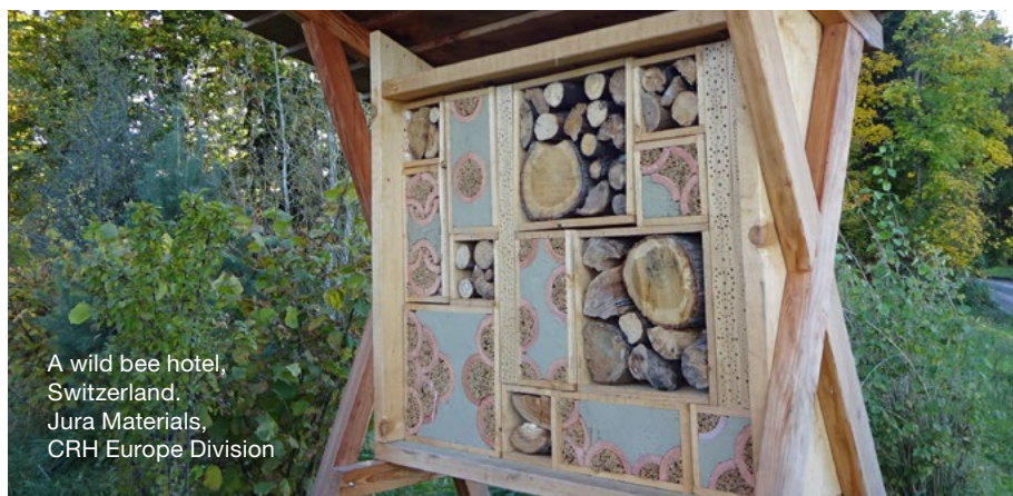
A wild bee hotel, Switzerland. Jura Materials, CRH Europe Division

We employ multifaceted assurance mechanisms to ensure that our suppliers uphold the standards set out in this SCoC. The methods of assurance are determined by: